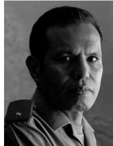
Sr. Taur Matan Ruak