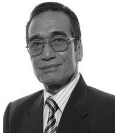
Dr. Francisco Guterres (Lu-Olo)

The United Nation will end its mission in Timor-Leste by December 30, 2012 For Further information please click here .